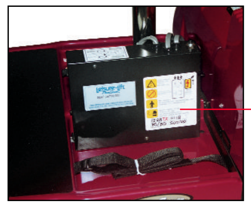
American made controller is enclosed & isolated. VA & CE moisture tested.